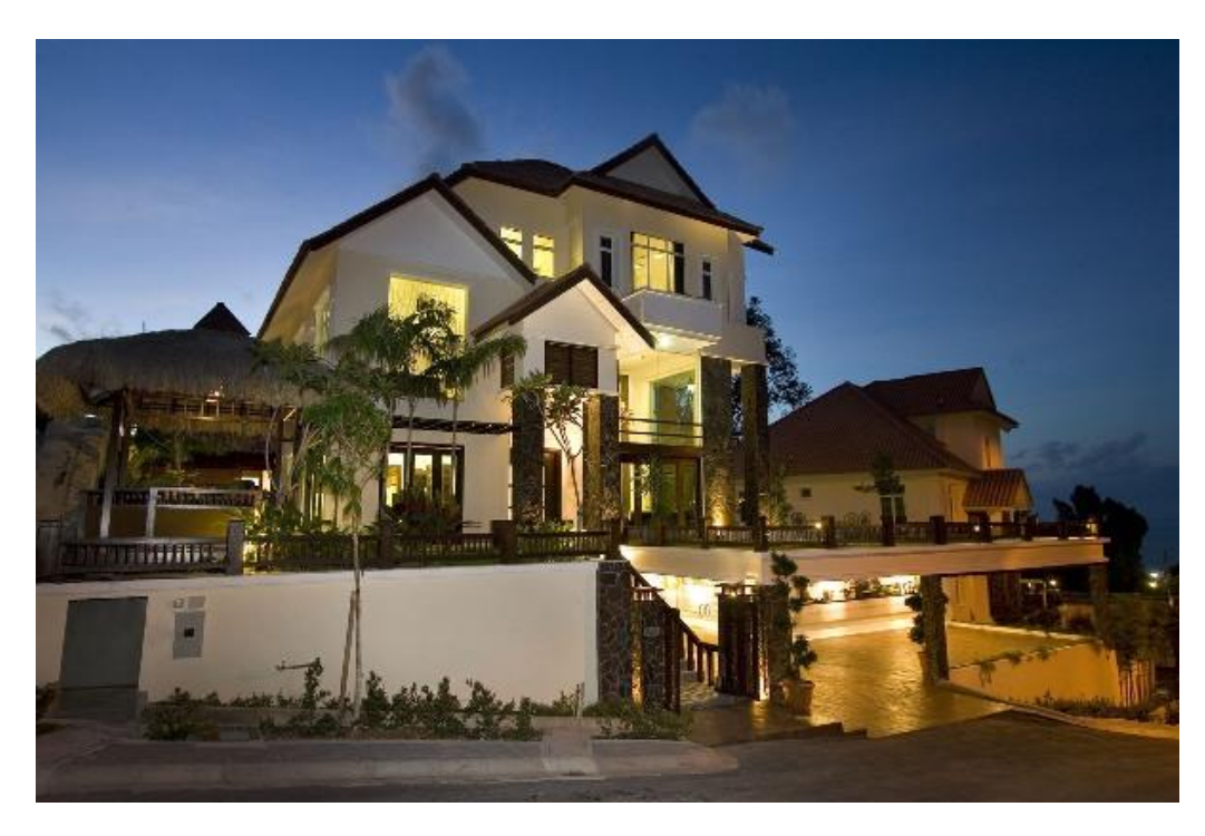
My Million Dollar Villa – The "Outcome" From Internet Information Business

writing this report (consider as "work"), I'm doing it in my villa and the only reason I'm able to have this house is because of my information marketing business.